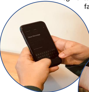
Pegwishtuk tah famille